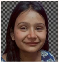
SWEETY FIRST POSITION