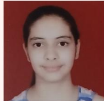
KUMKUM SECOND POSITION